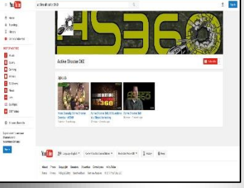
www.YouTube.com @active shooter 360

There is no simple solution to eliminate violence. But training your staff to recognize and respond safely to hostile incidents can be the difference between life and death. We are here to facilitate that training!