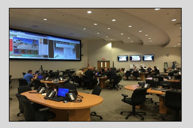
AS360 – Command Staff Tabletop for public safety hosted at county EOC facility.

Tabletop exercises are an effective means for evaluating decision based outcomes, supported by custom designed AS360 simulation technology. <u>Proprietary Custom SIM technology for</u> <u>advanced training opportunities:</u>